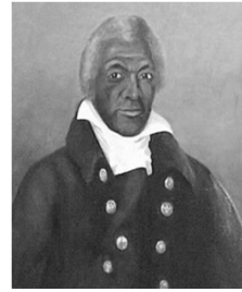
James Armistead (1760-1830)